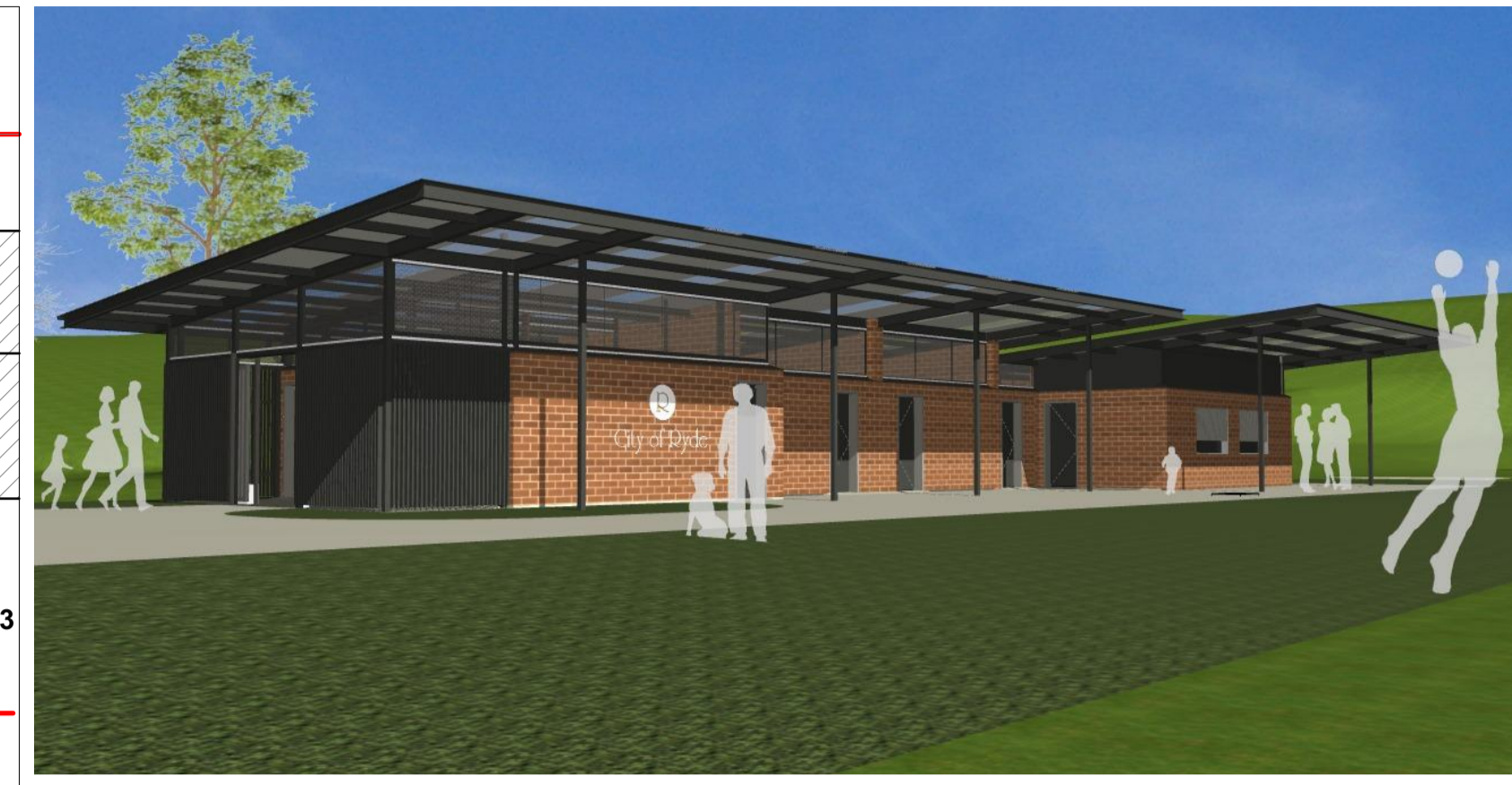
1 ARTIST IMPRESSION