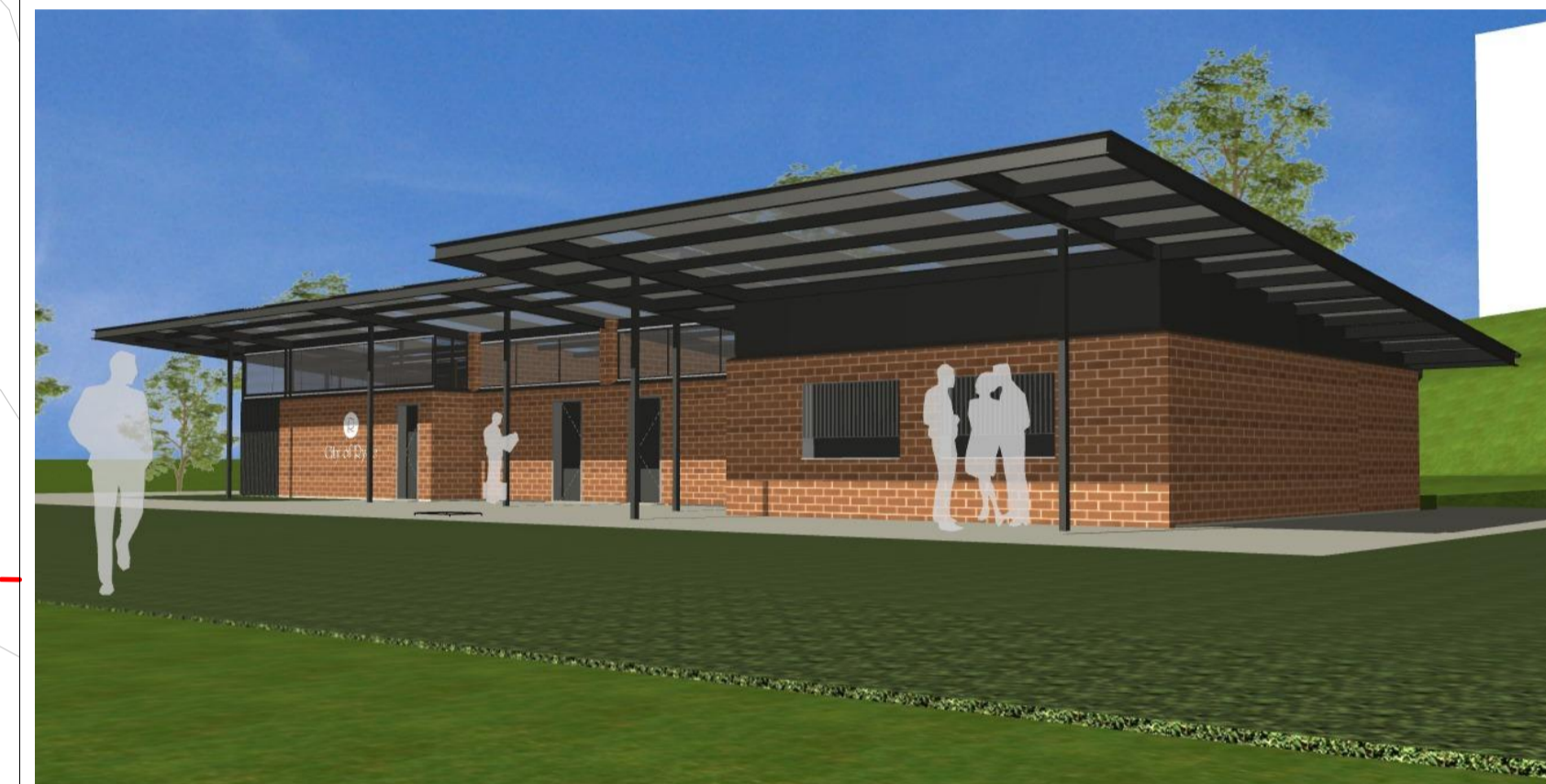
2 ARTIST IMPRESSION