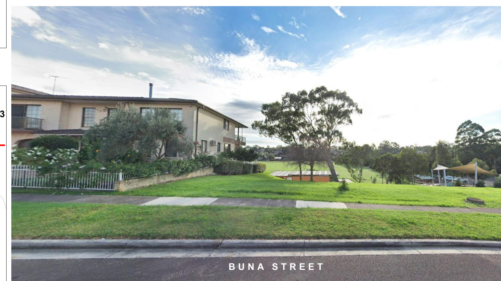
3 VIEW FROM BUNA STREET